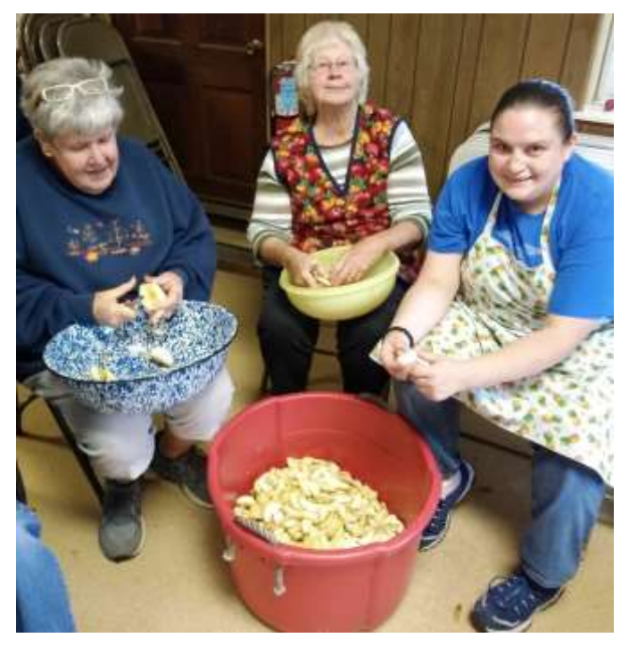
Grange members and friends gathered on Sept. 30<sup>th</sup> to help with apple schnitzing at Barner's Lutheran Church near Liverpool for the annual charity apple butter boil.